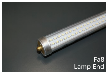
Fa8 Lamp End