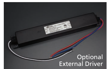
Optional External Driver