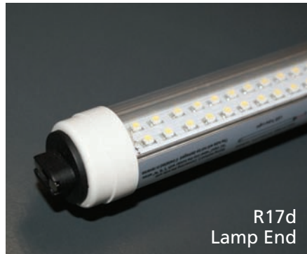
R17d Lamp End